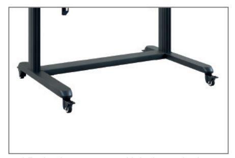
mobile thanks to castors with lock-type brake

In addition to the pre-configured systems, HAGOR offers customised special solutions in the LED sector, which can be individualised with accessories such as loudspeakers, controls and so on to meet all requirements.