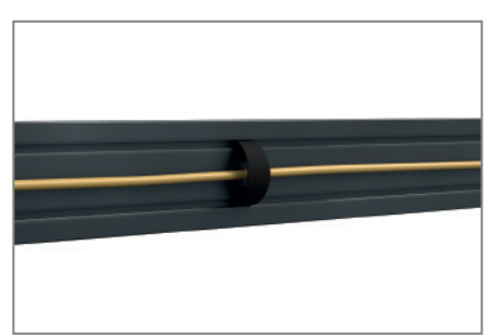
Cable routing with clips